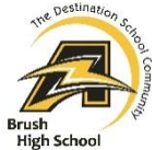
Brush High School