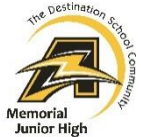
Memorial Junior High